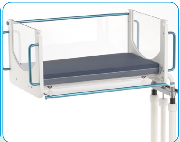
Cradle that can be opened and placed next to the bed