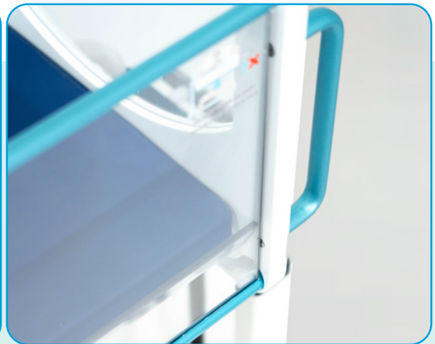
Front and rear carrying handles